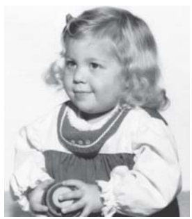
The ties that BOND